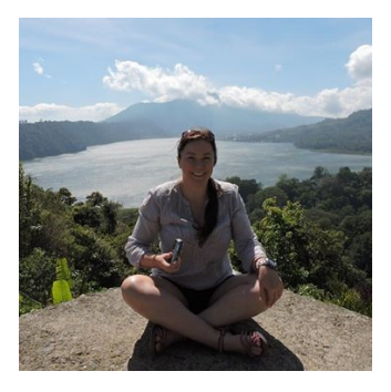
Ely - Stoney Cove